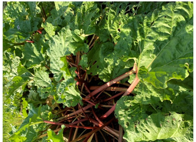
The Gardening Group went up to the allotment to plant their green peas, some tomatoes and harvested the rhubarb.

Next month it's 30 Days Wild. If you'd like to join in and do something to connect with nature each day in the month of June, just click on the Surrey Wildlife Trust's link: https://www.surreywildlifetrust.org/what-we-do/campaigning/30-days-wild