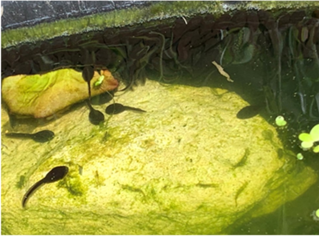
There are lots of tadpoles in the pond!